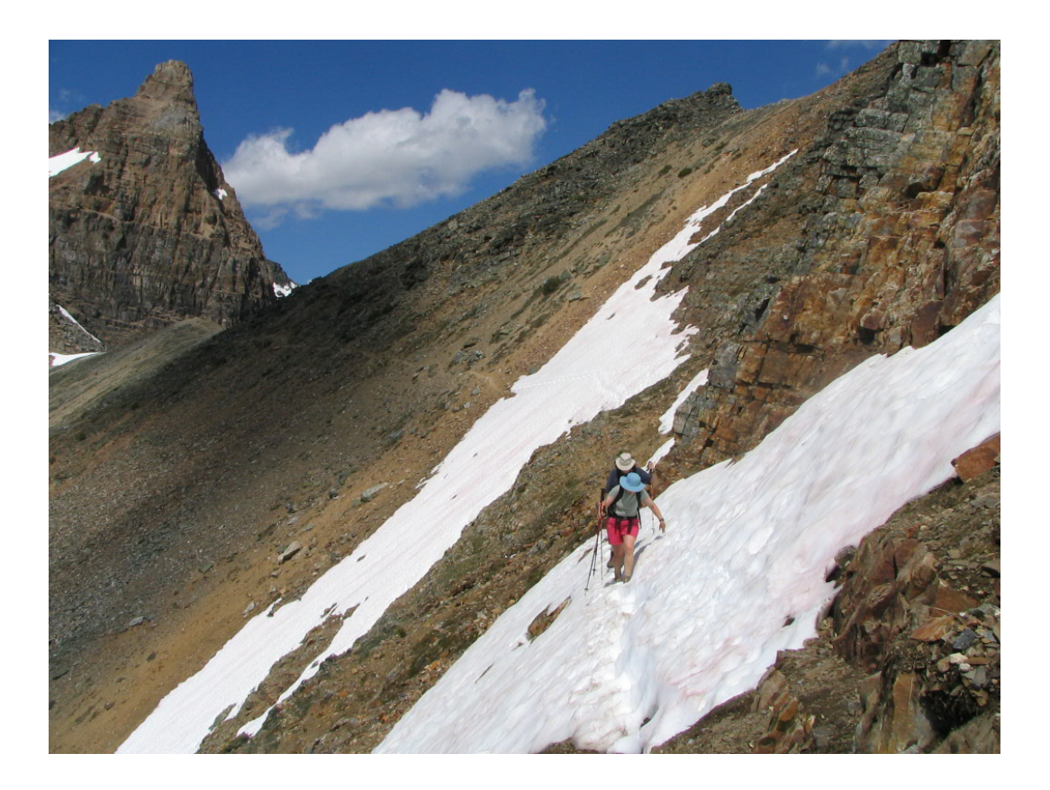
Huber Ledges Hiking time: Wiwaxy Gap to Lake Oesa – 50 min. Length: 1.7 km Elevation Loss: 260 m

The hike from Wiwaxy Gap to Lake Oesa via Huber Ledges Alpine Route provides more astounding views of the incomparable Lake O'Hara landscape. All four alpine lakes in the hanging valley lie beneath you. Mountain goats can often be spotted lazing on the grass-covered patches that pepper the slopes of Mt. Huber.