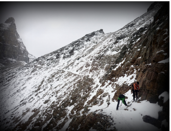
Exposure and snowy conditions on Wiwaxy Gap/Huber Ledges Trail.