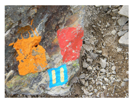
Alpine Route Markers (orange and red are old, blue and yellow are new)

The hike from Wiwaxy Gap to Lake Oesa via Huber Ledges Alpine Route provides more astounding views of the incomparable Lake O'Hara landscape. All four alpine lakes in the hanging valley lie beneath you. Mountain goats can often be spotted lazing on the grass-covered patches that pepper the slopes of Mt. Huber.