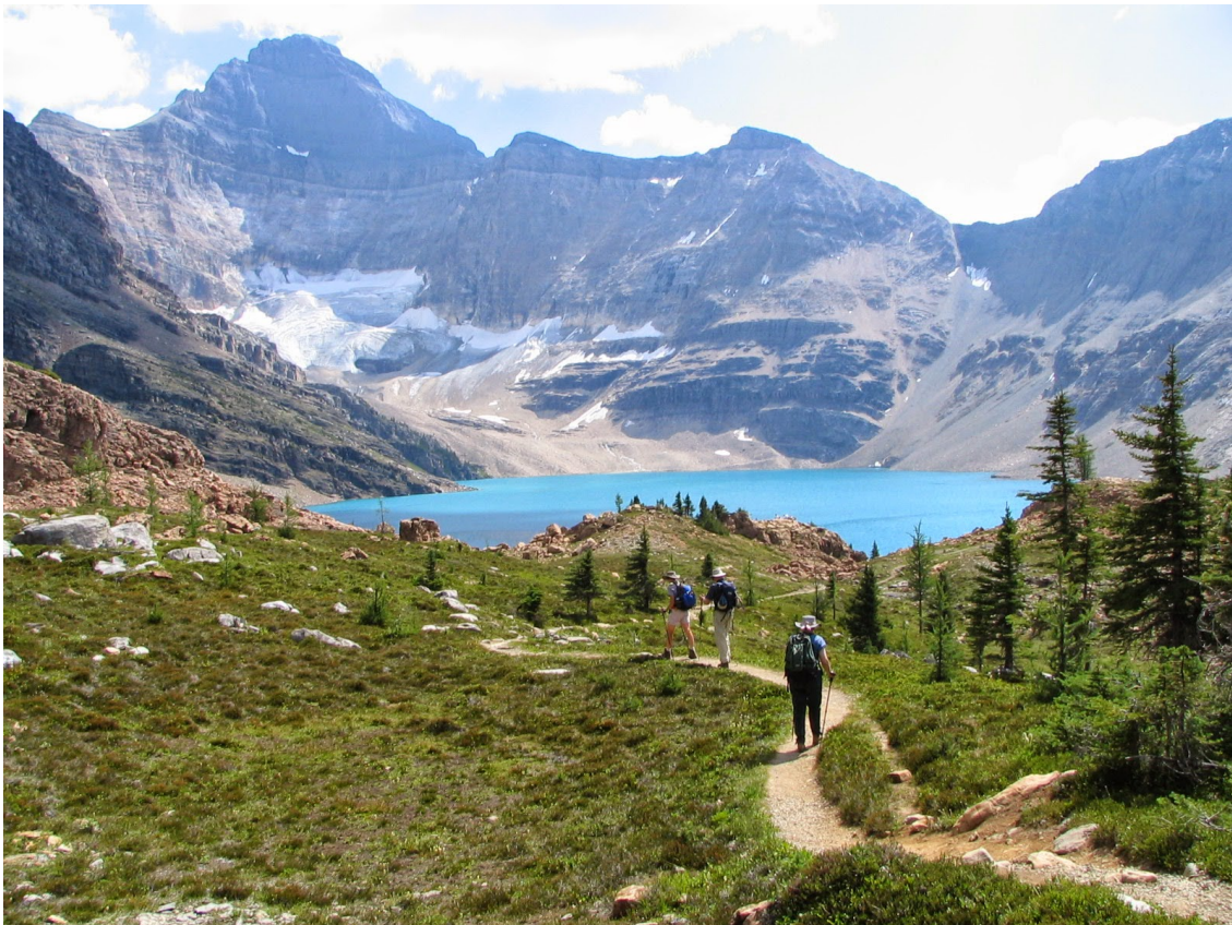
High-Level Circuit Trail Arriving at Lake McArthur

The High-Level Circuit Trail to Lake McArthur traverses a short grassy slope before climbing along a ledge and leveling off in the small meadow at the top. Beyond the meadow, a short uphill climb brings you to a knoll that offers stunning views of Mt. Biddle and Lake McArthur. Continue down to the lake and return the way you came, or complete the circuit by joining up with the Low-Level Circuit Trail.