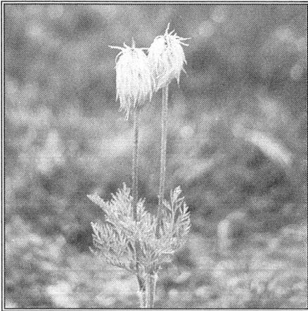
Western Anemone in seed

This species, a member of the buttercup family, prefers damp