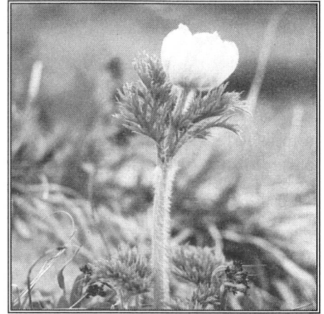
Western Anemone in flower

Autumn winds disperse the parachute-like plumed seeds to new sites, where they may flourish and enhance the visual delights of environments such as found around Lake O'Hara.